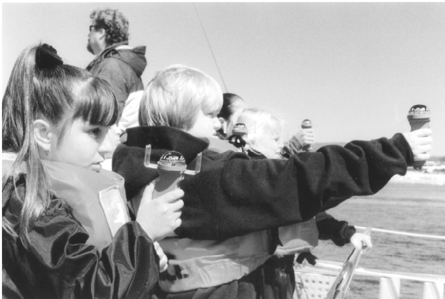
Sea Odyssey students take compass bearings as part of the navigation station onboard the Team O'Neill catamaran.

“Many who do not do well in a classroom setting, excel at outdoor science school. They are able to gain a wealth of background knowledge we use for nearly every other academic area.” This quote is from a teacher whose class participated in a research study funded under mandate of California Assembly Bill 1330 entitled “The Effects of Outdoor Education Programs for Children in California”.